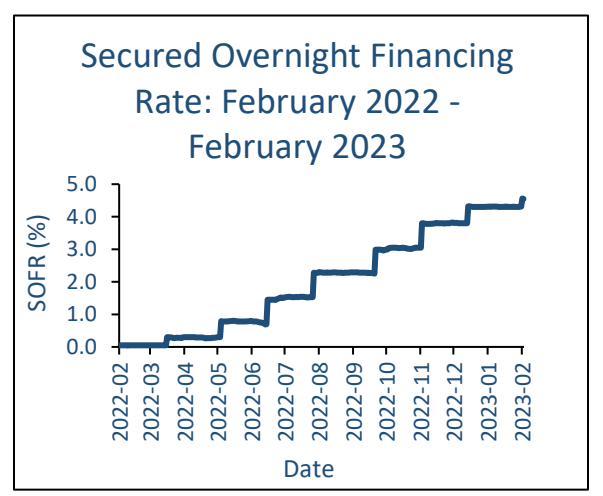
The Secured Overnight Financing Rate ("SOFR") has increased by 425 basis points since March 2022. (Source: Federal Reserve Economic Data)

Dislocation in real estate financing has become widespread because of the increase in borrowing costs. Without sufficient NOI to cover debt costs, some owners of real estate are forced into selling their properties to relieve the burden of incurring expensive financing. Even real estate investors who have hedged interest rates are seeing distress as their interest rate caps begin to expire. In 2020-2021 when the Federal Funds Rate was essentially 0%, interest rate caps on multimillion dollar loans could be purchased for as low as $10,000. The cost to hedge the same loan today has increased tenfold.<sup>1</sup>